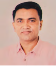
Dr. Pramod Sawant Chief Minister, Goa